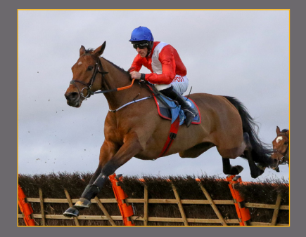
ENVOI ALLEN Multiple Gr. 1 winner incl Ballymore Novices' Hurdle, Gr. 1 sold Cheltenham February Sale 2018 by Milestone Stables to Tom Malone for £400,000