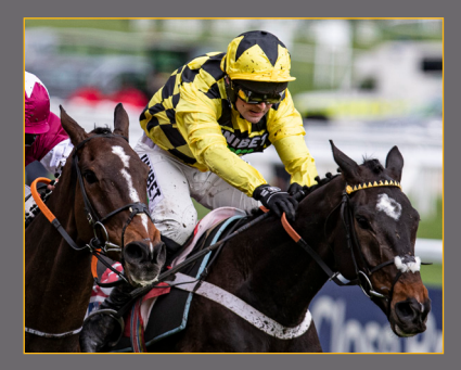
SHISHKIN winner of Sky Bet Supreme Novies' Hurdle, Gr. 1 sold Cheltenham Decemeber Sale 2018 by Virginia Considine to Highflyer Bloodstock for £170,000