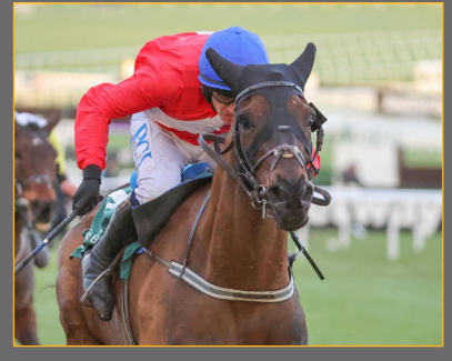
FERNY HOLLOW winner of Weatherbys Champion Bumper, Gr. 1 sold Cheltenham February Sale 2019 by Milestone Stables to Harold Kirk / WP Mullins for £300,000